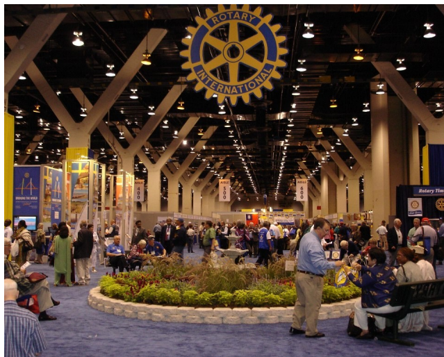
A House of Friendship scene